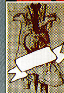
FOR ART'S SAKE: (Clockwise from left-facing page) Artwork from Iraqi House gallery; artwork by Kelly Crosby; artwork from Al Maraya gallery; artwork by Laudi Abilama; artwork from Saatchi Online; artwork by Emirati House. BAF will include exhibits by individual participants, galleries and internationally-acclaimed curators